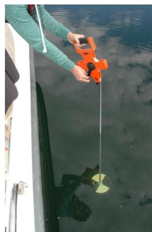
Measuring water clarity with a Secchi Disk on the shady side of the boat

Secchi Depth – This is the measurement of water clarity. There are many things that influence water clarity. Algae, zooplankton, silt and dirt, and anything else that is suspended in the water can affect clarity. Water also has dissolved elements (e.g., tannic acids from decomposing organic matter) that change the color of water and impact clarity. Water clarity is mostly influenced by planktonic algae in Barr and Milton. During major rain events, incoming water can be turbid from dirt and urban runoff. Clarity is another response variable to the overall condition of the reservoir and the watershed.